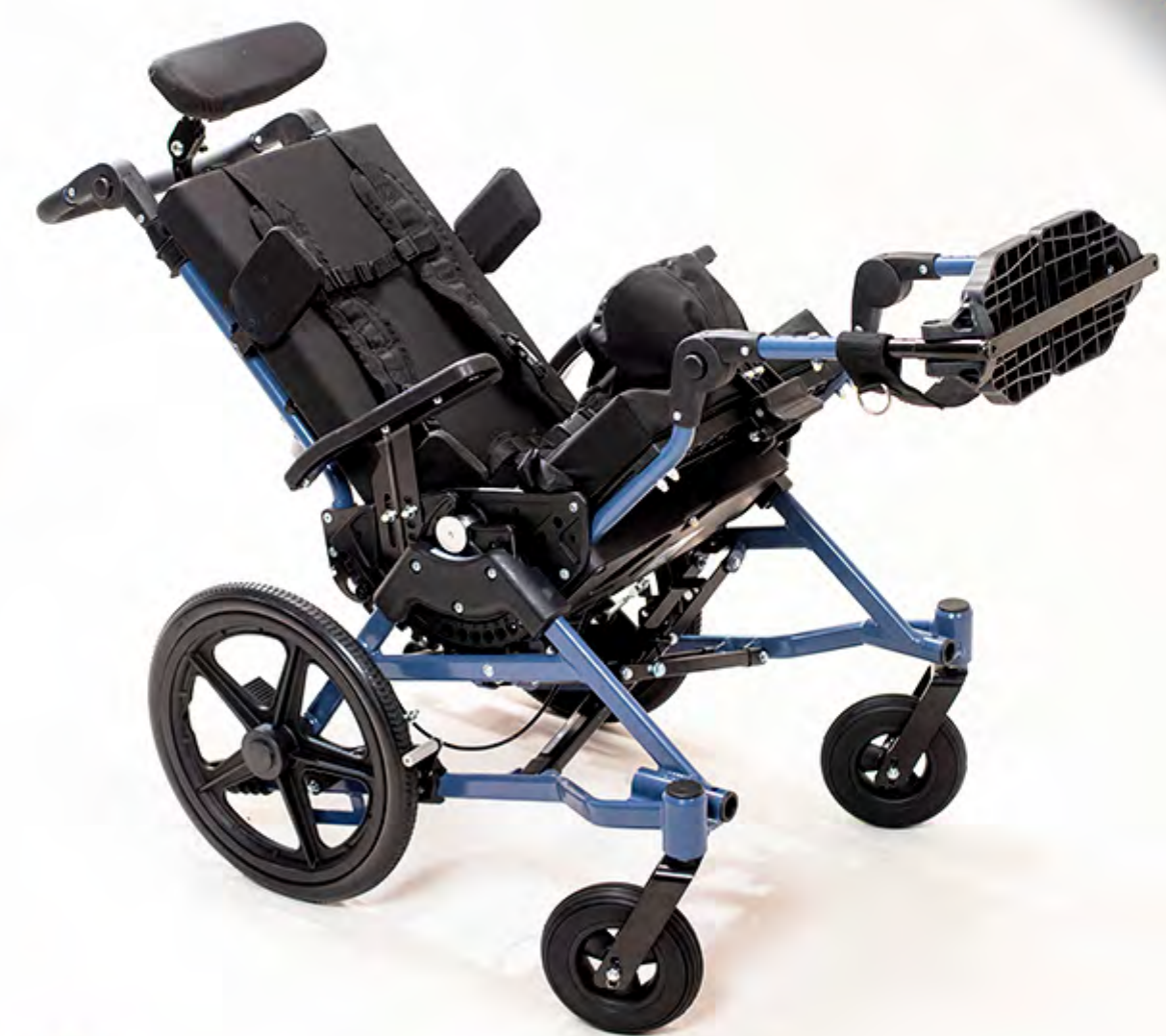
Tilts & Reclines