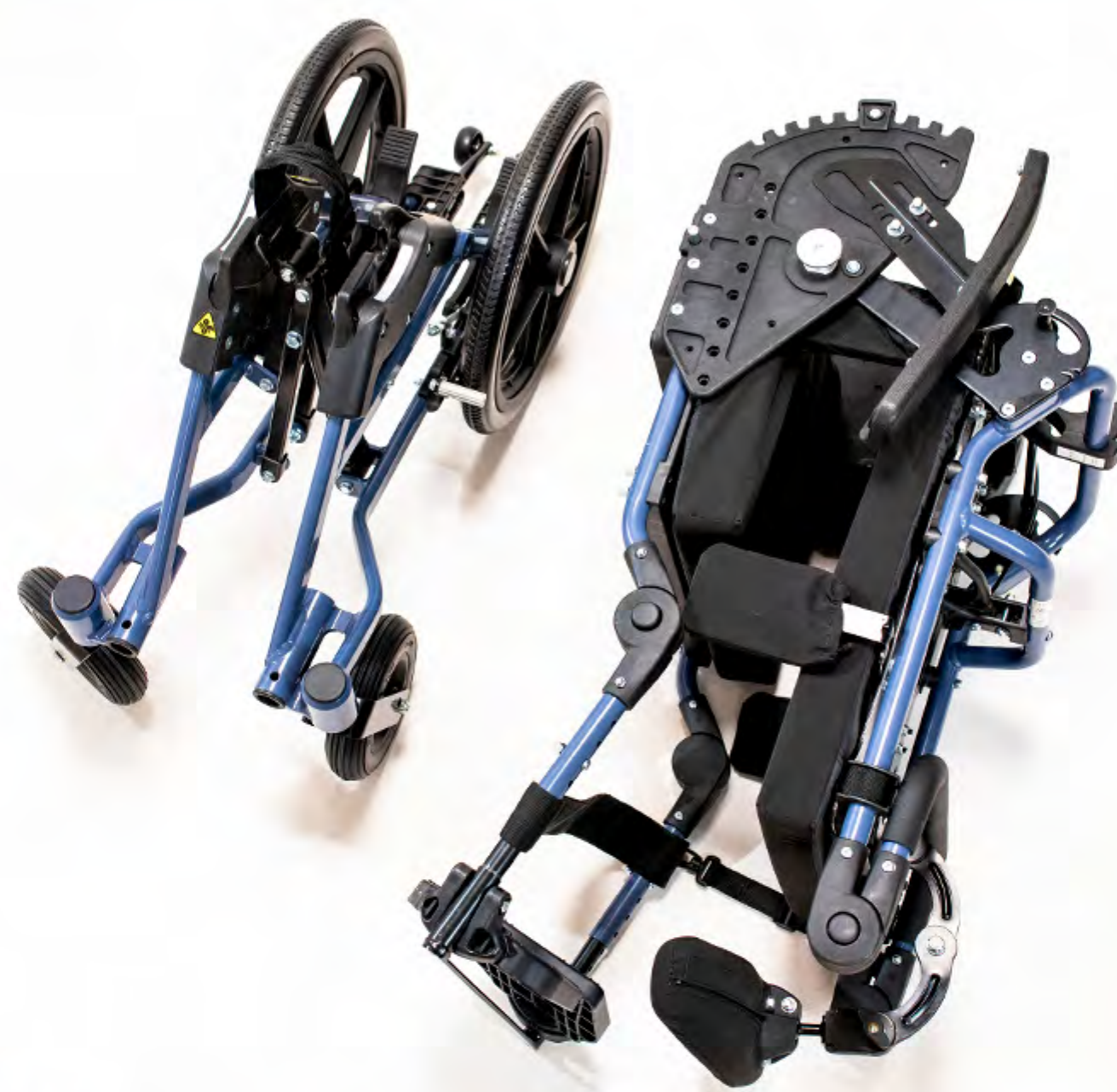
Lightweight & Folding