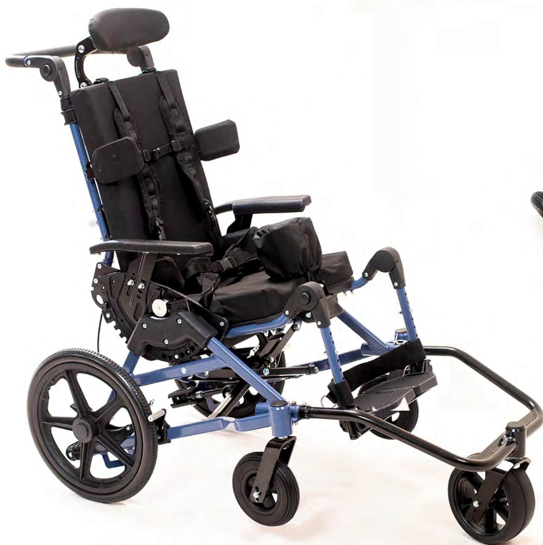
Trike or Wheelchair

www.participant.life /participantap @participantap @participant_ap